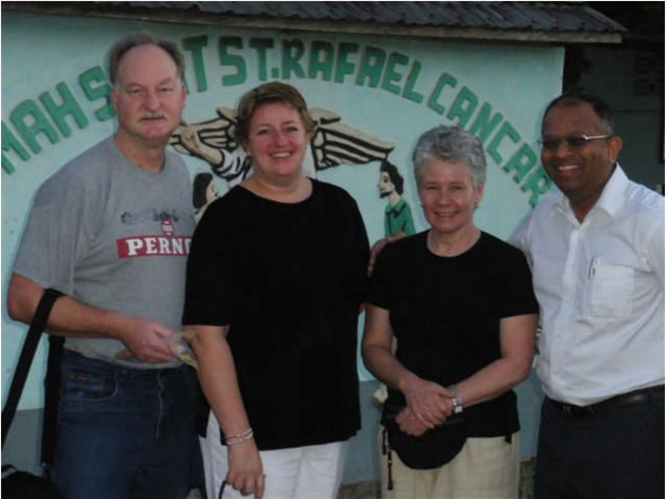
Team members outside St Raphael Hospital.