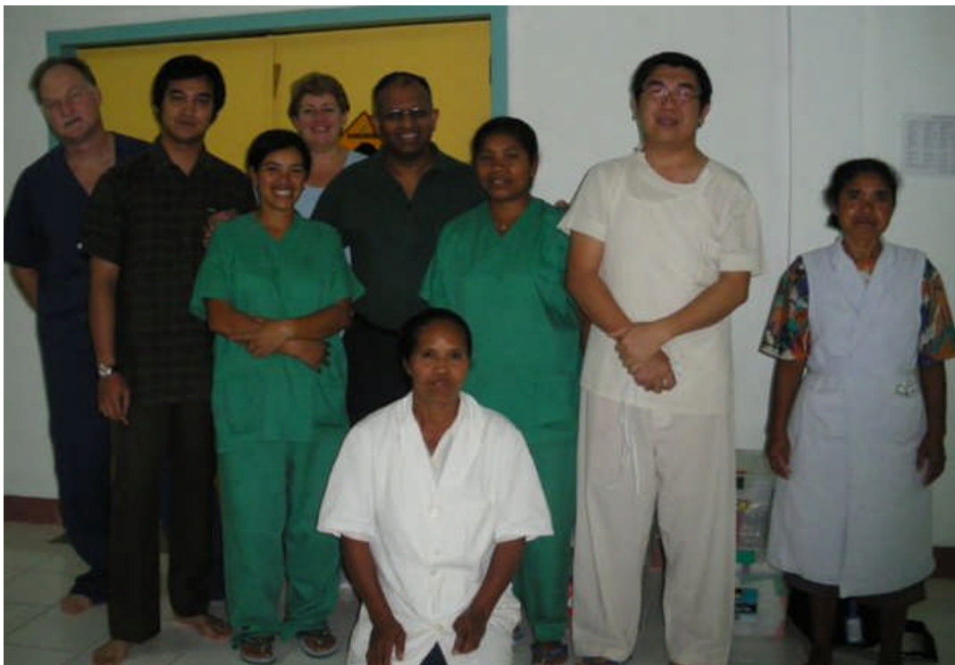
Team with local hospital staff